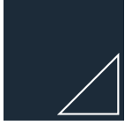
Anthracite Grey Smooth / Anthracite Grey Smooth (Grey Base)