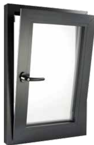
Tilt mode - top ventilation position