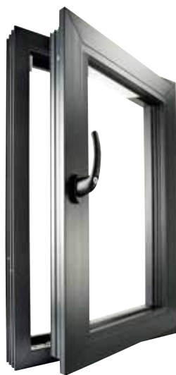
Turn mode - maximum ventilation and for cleaning of outside pane

In the tilt mode the window offers secure ventilation, an important factor in ground floor installations. The tilt-turn gearing prevents selection from tilt to turn, while in tilt mode and vice versa. Anti-slam is fitted as standard and the gearing is concealed for improved aesthetics.