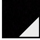
Black Brown / White PVC-U (White Base)