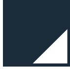
Anthracite Grey Smooth / White PVC-U (White Base)